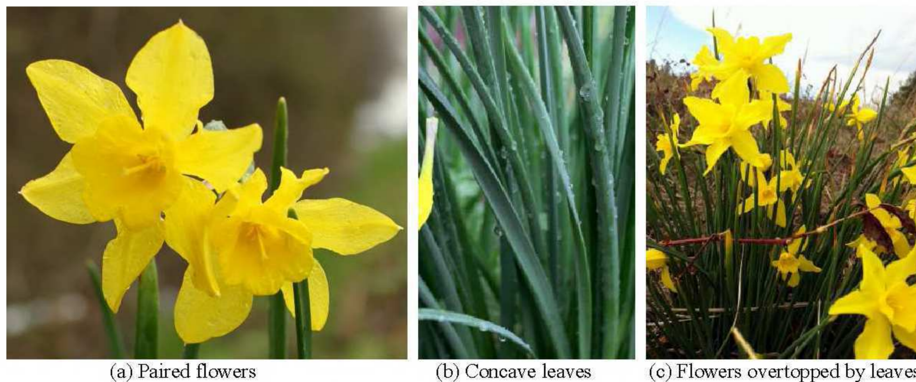
Figure 5. Narcissus × odorus . (a & b) Roadside, Lowndes Co., Alabama, 6 Mar 2014. (c) Old field, Calhoun Co., Alabama, 14 Mar 2014.

4. Narcissus × odorus Linnaeus {scented} [ N. jonquilla × N. pseudonarcissus ] — CAMPERNELLE JONQUIL; SWEET-SCENTED JONQUIL (Fig. 5). Roadsides, fields, pastures and other open disturbed areas; throughout Alabama; common; February–April. This common hybrid is sterile and spreads through asexual means. Narcissus × odorus is often confused with N. pseudonarcissus , but is usually multi-flowered, has golden yellow tepals that are distinctly longer than the corona, and grooved, narrow leaves that often overtop the flowers. Narcissus × odorus is also similar to N. ×intermedius and N. jonquilla , but their flowers are much smaller. [GA, MS, TN]